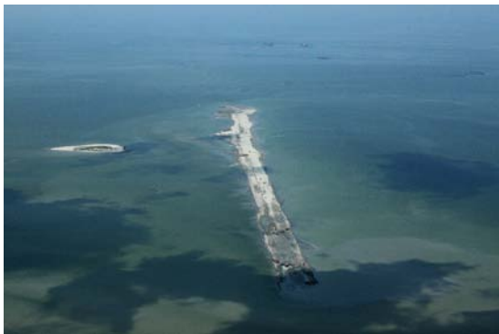
E4 Berm – August 5, 2010