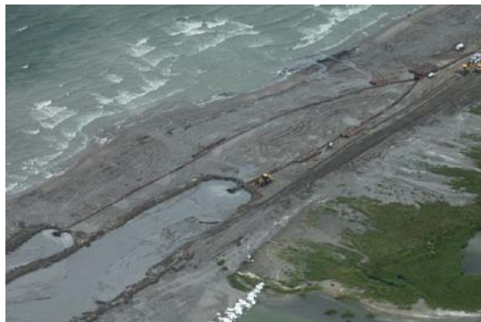
W9 Berm Construction – August 5, 2010

Note: Percent complete of material handled represents only 1 of 3 elements of percent complete for the overall project.