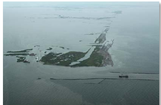
W9 Berm – August 5, 2010