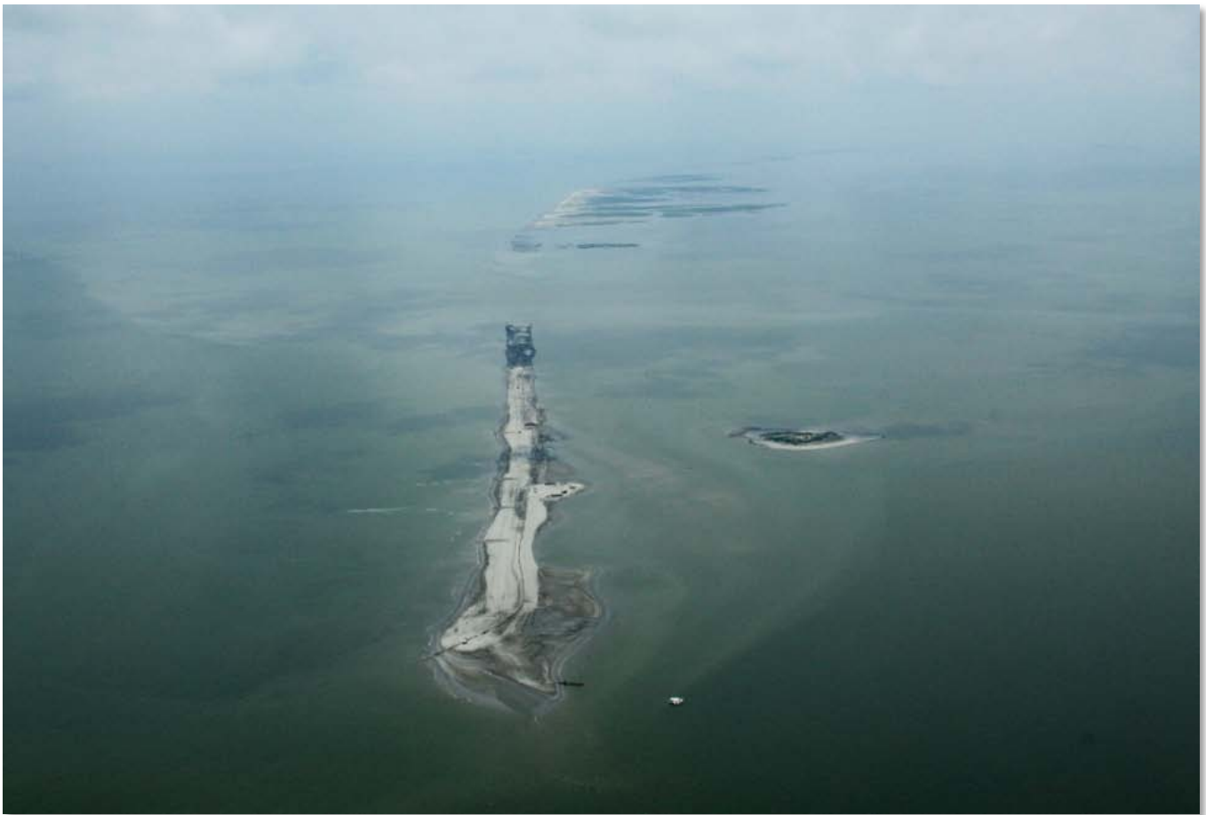
E4 North Berm – August 5, 2010

Shaw Environmental & Infrastructure Group