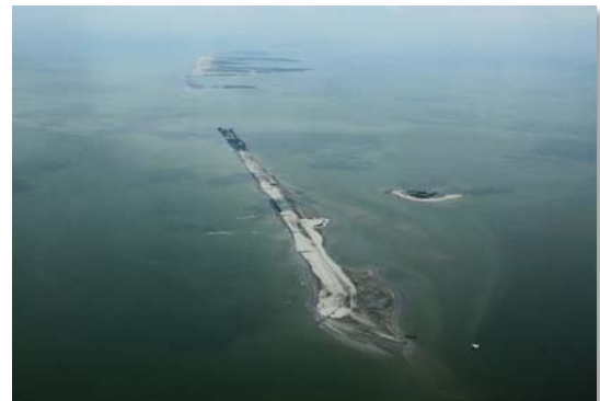
E4 Berm Construction – August 5, 2010