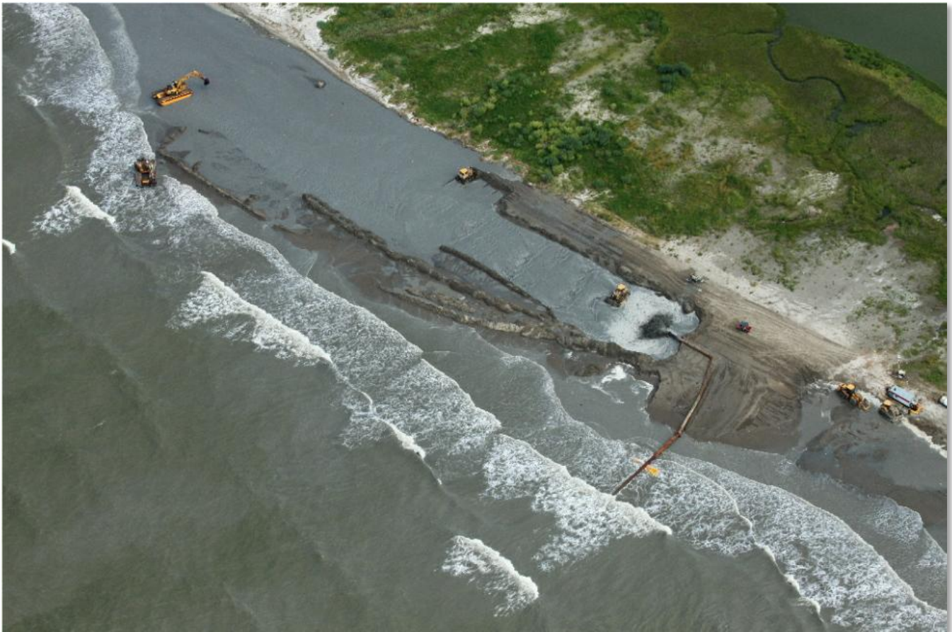
W9 Berm – July 27 th , 2010

Shaw Environmental & Infrastructure Group