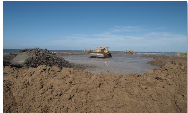
W9 Berm Construction – July 27, 2010