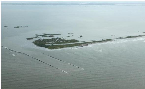
W9 Berm Aerial Photo - July 27, 2010