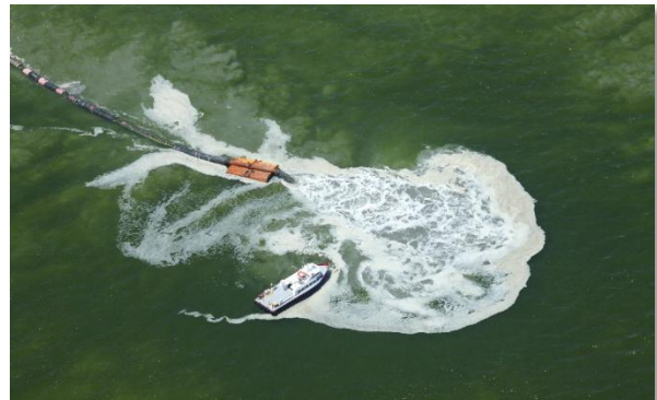
E4 Berm 6A refill – July 27, 2010