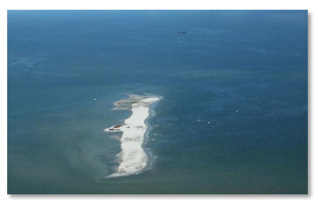
E4 Berm Aerial Photo - July 27, 2010