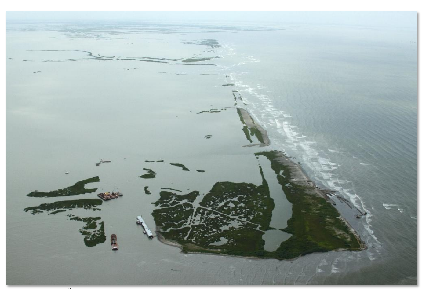
W9 Berm – July 27<sup>th</sup>, 2010

Shaw Environmental & Infrastructure Group