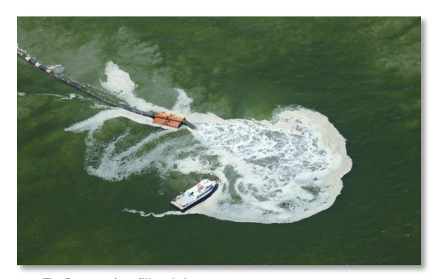
E4 Berm 6A refill – July 27, 2010