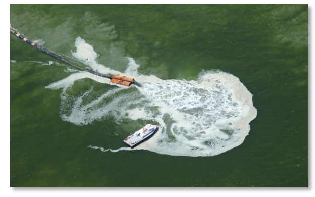
E4 Berm 6A refill – July 27, 2010