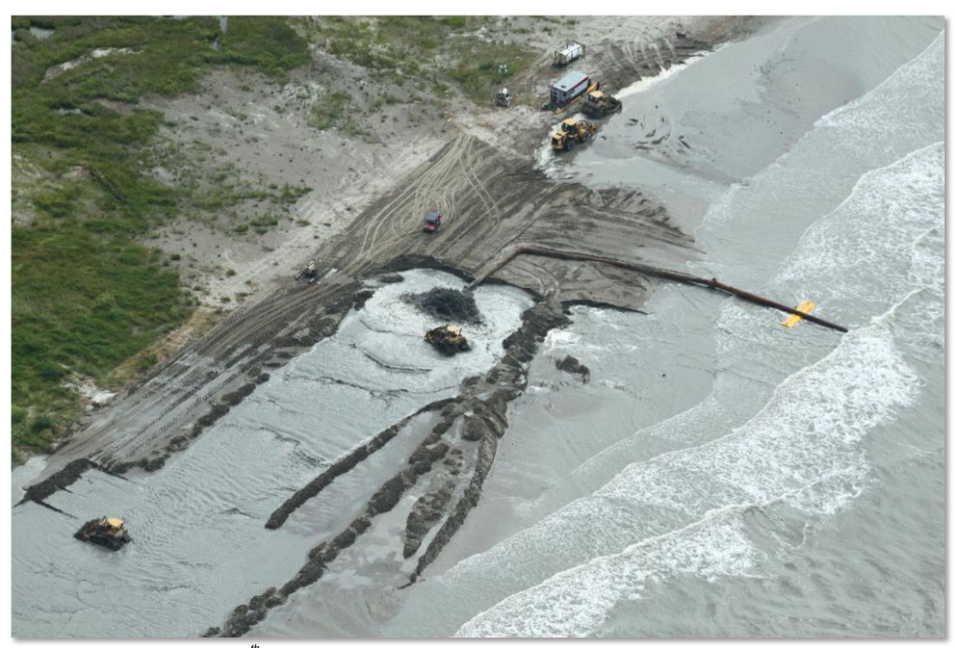
W9 Berm Construction – July 27<sup>th</sup>, 2010

Shaw Environmental & Infrastructure Group