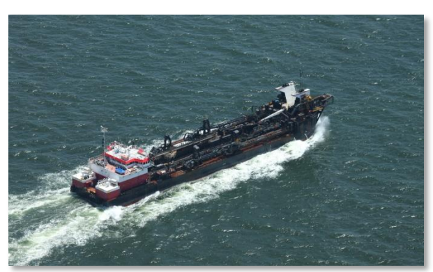
RN Weeks hopper dredge - July 22, 2010