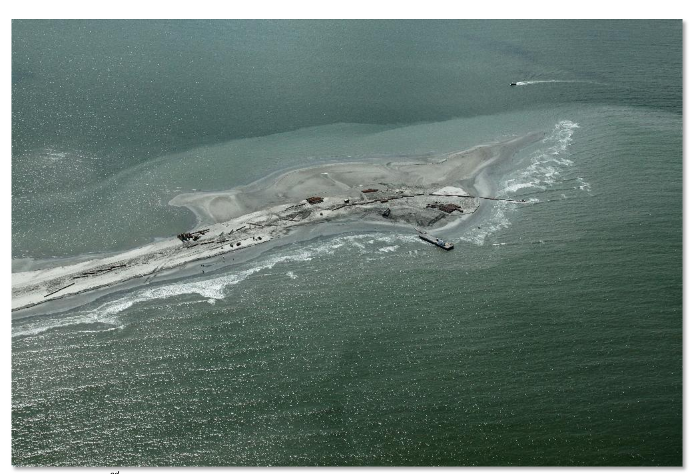
E4 Berm – July 22<sup>nd</sup>, 2010

Shaw Environmental & Infrastructure Group