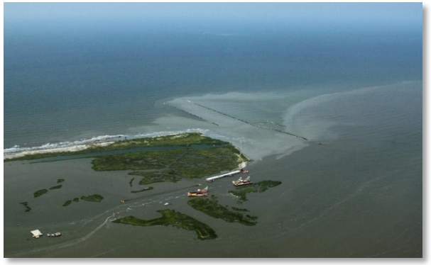
W9 Aerial Photo - July 22, 2010