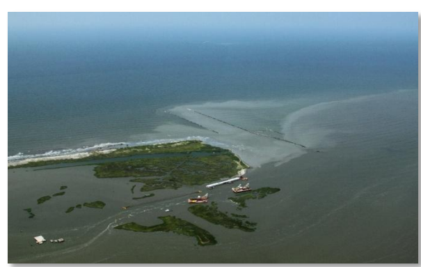
W9 Aerial Photo – July 22, 2010