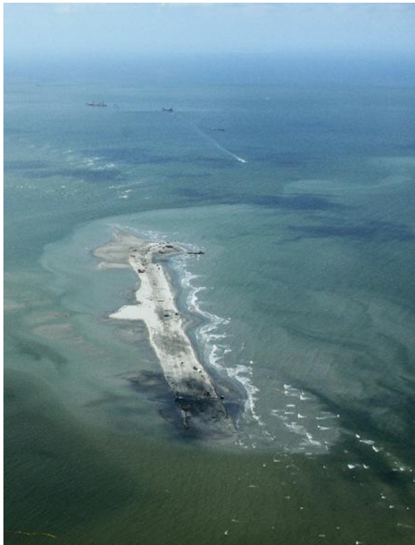
E4 Berm - July 19, 2010

Note: Percent complete of material handled represents only 1 of 3 elements of percent complete for the overall project.