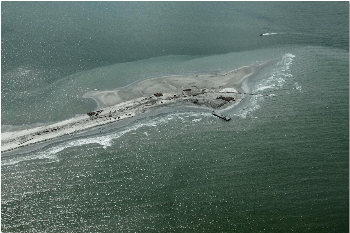
E4 Berm – July 20, 2010

Prepared by: Shaw Environmental & Infrastructure Group