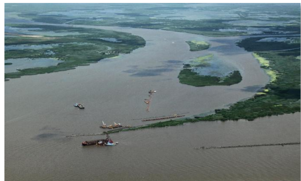
Pass a Loutré – July 20, 2010