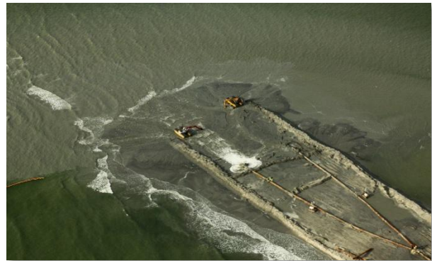
E4 Berm Operations – July 19, 2010