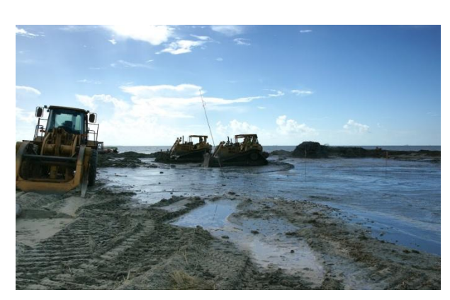
W9 Berm Operations – July 20, 2010