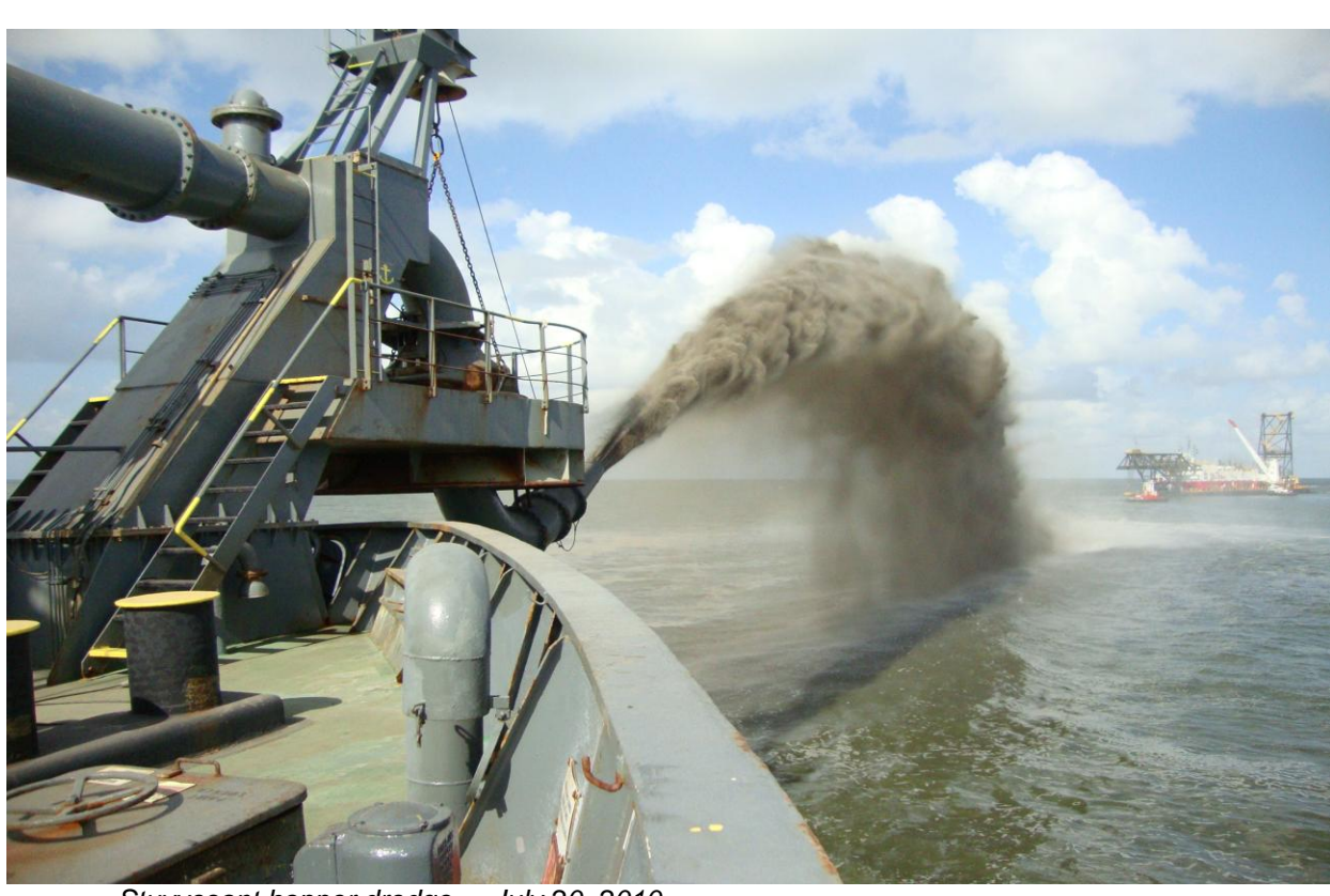
Stuyvesant hopper dredge - July 20, 2010

Shaw Environmental & Infrastructure Group