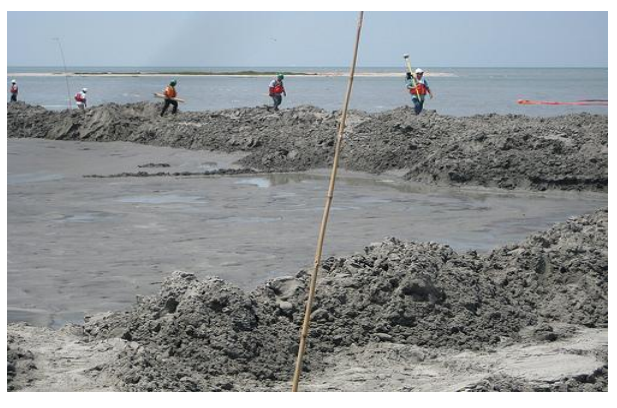
Berm E4 – July 15, 2010