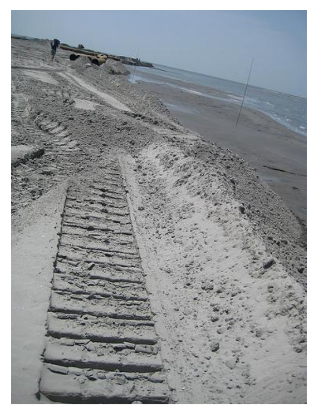
On Berm Reach E4 – July 15, 2010

Note: Percent complete of material handled represents only 1 of 3 elements of percent complete for the overall project.