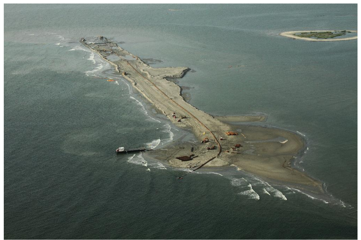
E4 Berm – July 19, 2010

Prepared by: Shaw Environmental & Infrastructure Group