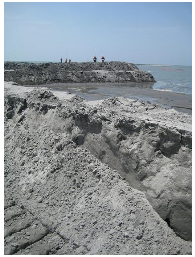
On Berm Reach E4 – July 15, 2010

Note: Percent complete of material handled represents only 1 of 3 elements of percent complete for the overall project.