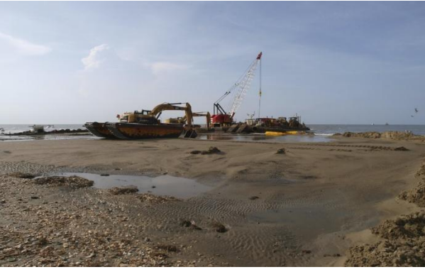
W9 Berm Operations - July 19, 2010