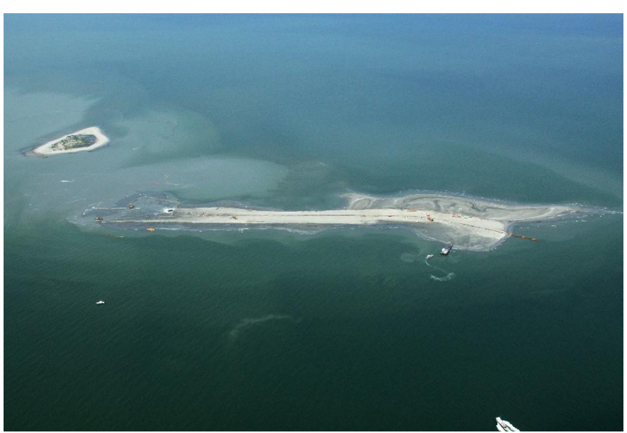
E4 Berm - July 15, 2010