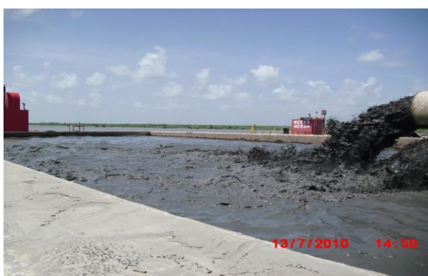
Spider loading scow - July 15<sup>th</sup>

Note: Percent complete of material handled represents only 1 of 3 elements of percent complete for the overall project.