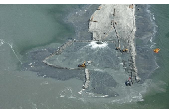
E4 Berm Construction - July 13th