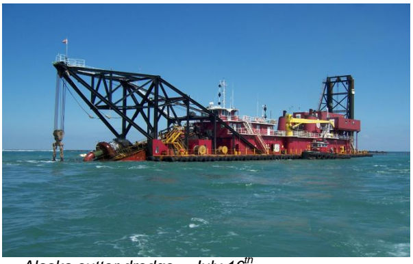
Alaska cutter dredge – July 16<sup>th</sup>