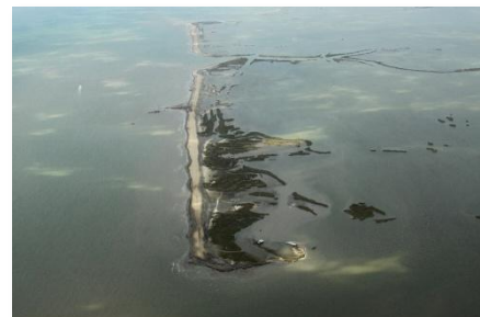
W10 Berm – November 28, 2010