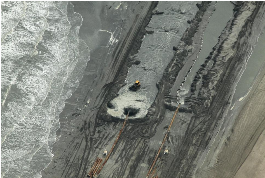
E4 North Berm Operations – November 28, 2010

Shaw Environmental & Infrastructure Group