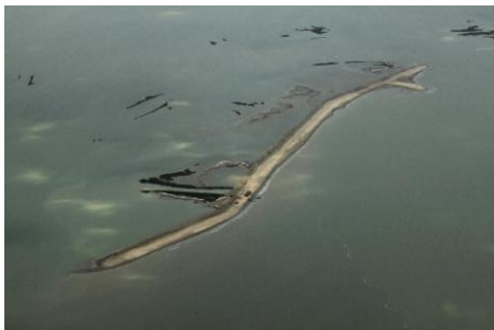
W8 Berm – November 28, 2010

Note: Under Construction represents linear footage of berm placed; all material may not yet conform to elevation +6.