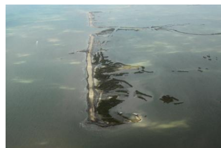
W10 Berm – November 28, 2010