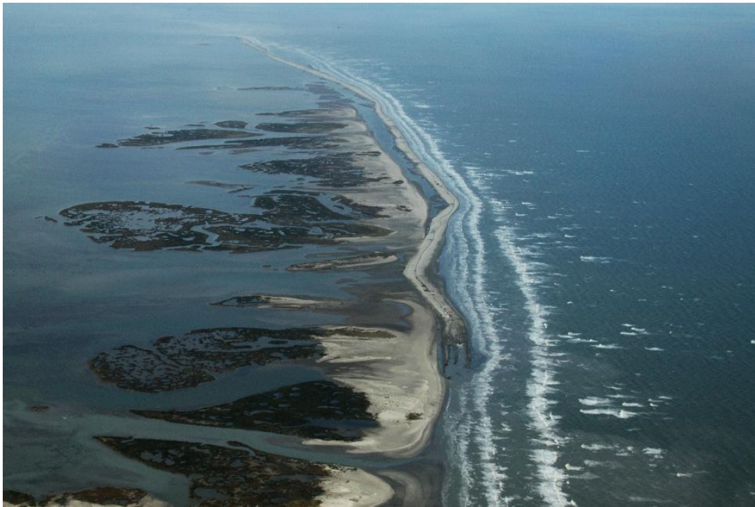
E4 North Berm – November 28, 2010

Shaw Environmental & Infrastructure Group