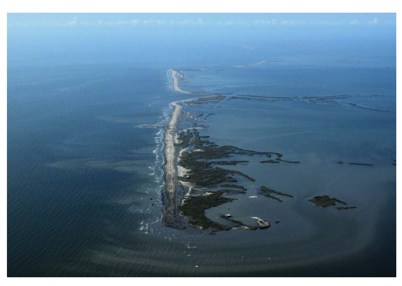
West Berm Operations - November 23, 2010

Shaw Environmental & Infrastructure Group