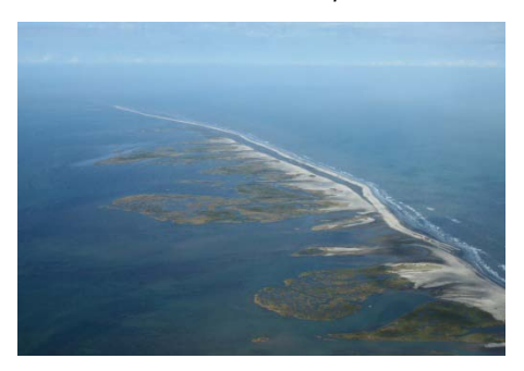
E4 Berm Operations – November 23, 2010

Note: Under Construction represents linear footage of berm placed; all material may not yet conform to elevation +6.