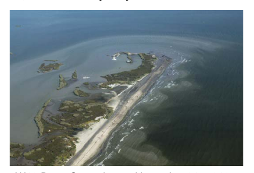
W10 Berm Operations – November 23, 2010