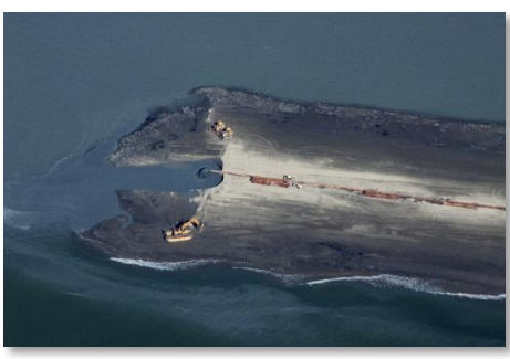
W8 Berm Operations - November 21, 2010

Note: Under Construction represents linear footage of berm placed; all material may not yet conform to elevation +6.