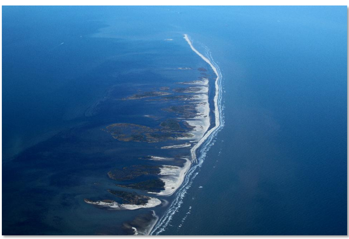
E4 North Berm - November 21, 2010

Shaw Environmental & Infrastructure Group