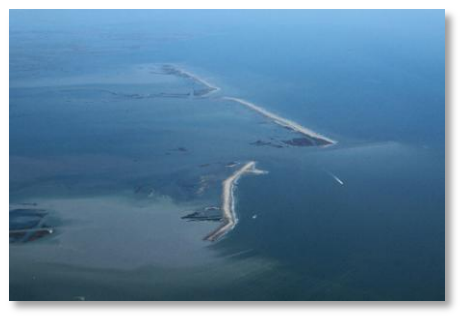
W8, W9, & W10 Berms - November 21, 2010