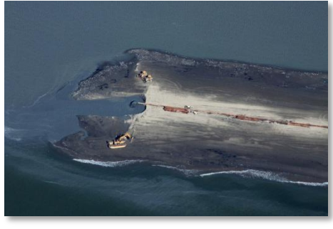
W8 Berm Operations - November 21, 2010

Note: Under Construction represents linear footage of berm placed; all material may not yet conform to elevation +6.