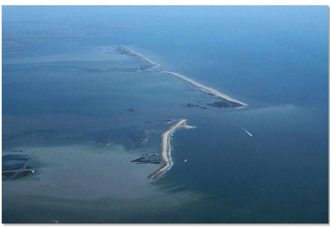
W8, W9, & W10 Berms - November 21, 2010

Shaw Environmental & Infrastructure Group