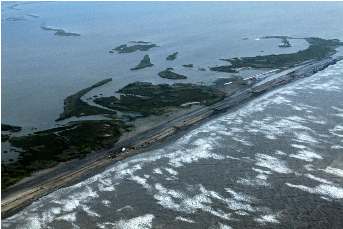
W10 Berm Operations – November 16, 2010

Shaw Environmental & Infrastructure Group