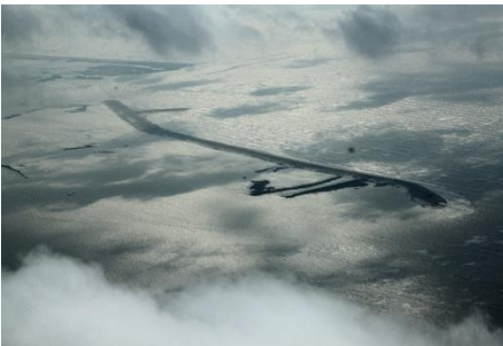
W8 Berm – November 16, 2010

Note: Under Construction represents linear footage of berm placed; all material may not yet conform to elevation +6.