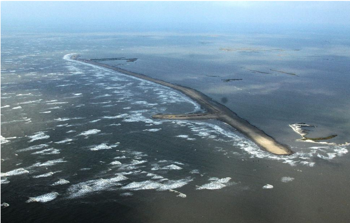
W8 Berm – November 16, 2010

Shaw Environmental & Infrastructure Group