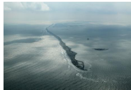
E4 North Berm – November 16, 2010