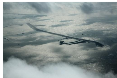
W8 Berm – November 16, 2010