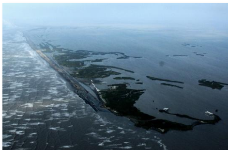
W10 Berm – November 16, 2010

Note: Under Construction represents linear footage of berm placed; all material may not yet conform to elevation +6.