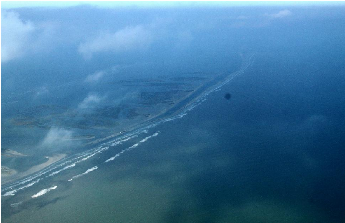
E4 North Berm – November 16, 2010

Prepared by: Shaw Environmental & Infrastructure Group