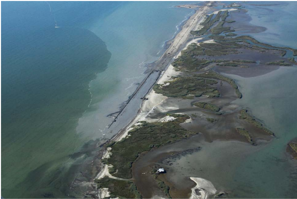
W10 Berm – November 10, 2010

Shaw Environmental & Infrastructure Group