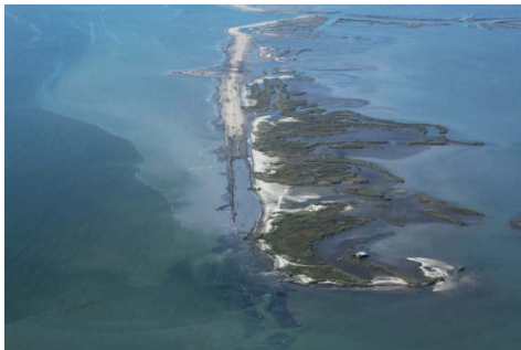
W10 Berm – November 10, 2010

Note: Under Construction represents linear footage of berm placed; all material may not yet conform to elevation +6.