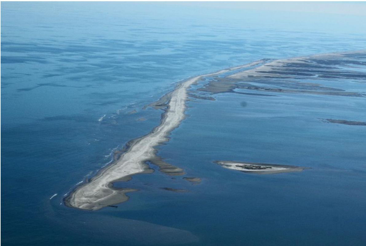
E4 North Berm – November 10, 2010

Prepared by: Shaw Environmental & Infrastructure Group