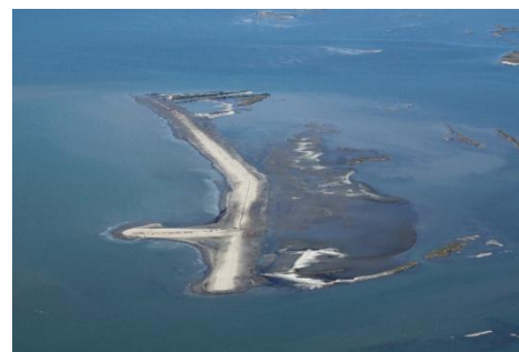
W8 Berm – November 10, 2010