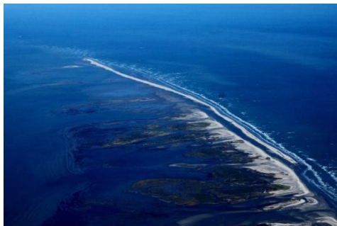
E4 Berm – November 7, 2010

Note: Under Construction represents linear footage of berm placed; all material may not yet conform to elevation +6.