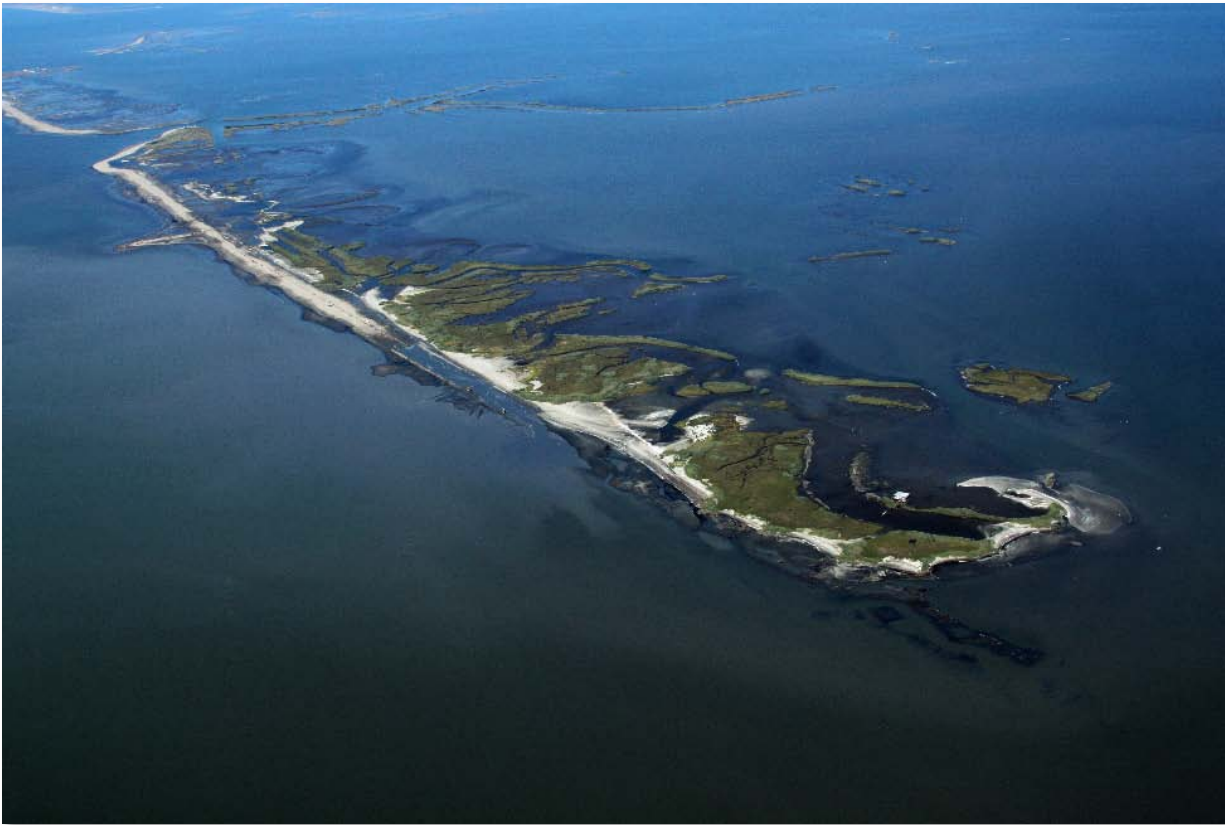
W10 Berm – November 7, 2010

Shaw Environmental & Infrastructure Group