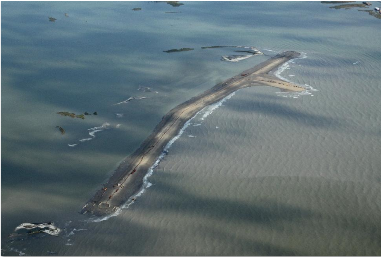
W8 Berm – November 3, 2010

Shaw Environmental & Infrastructure Group