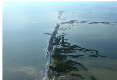
W10 Berm – November 3, 2010