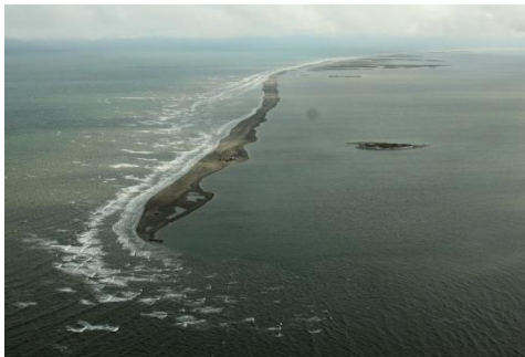
E4 Berm – November 3, 2010

Note: Under Construction represents linear footage of berm placed; all material may not yet conform to elevation +6.