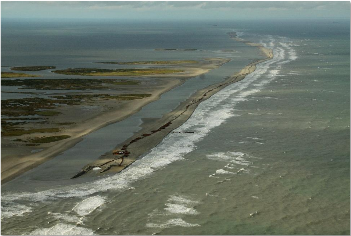
E4 North Berm – November 3, 2010

Shaw Environmental & Infrastructure Group