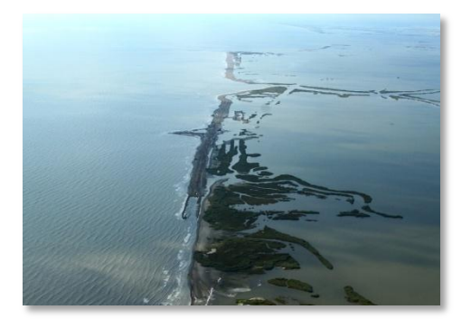
W10 Berm - November 3, 2010