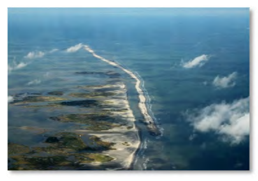
E4 Berm - October 31, 2010

Note: Under Construction represents linear footage of berm placed; all material may not yet conform to elevation +6.