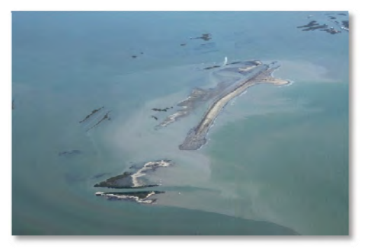
W8 Berm - October 31, 2010