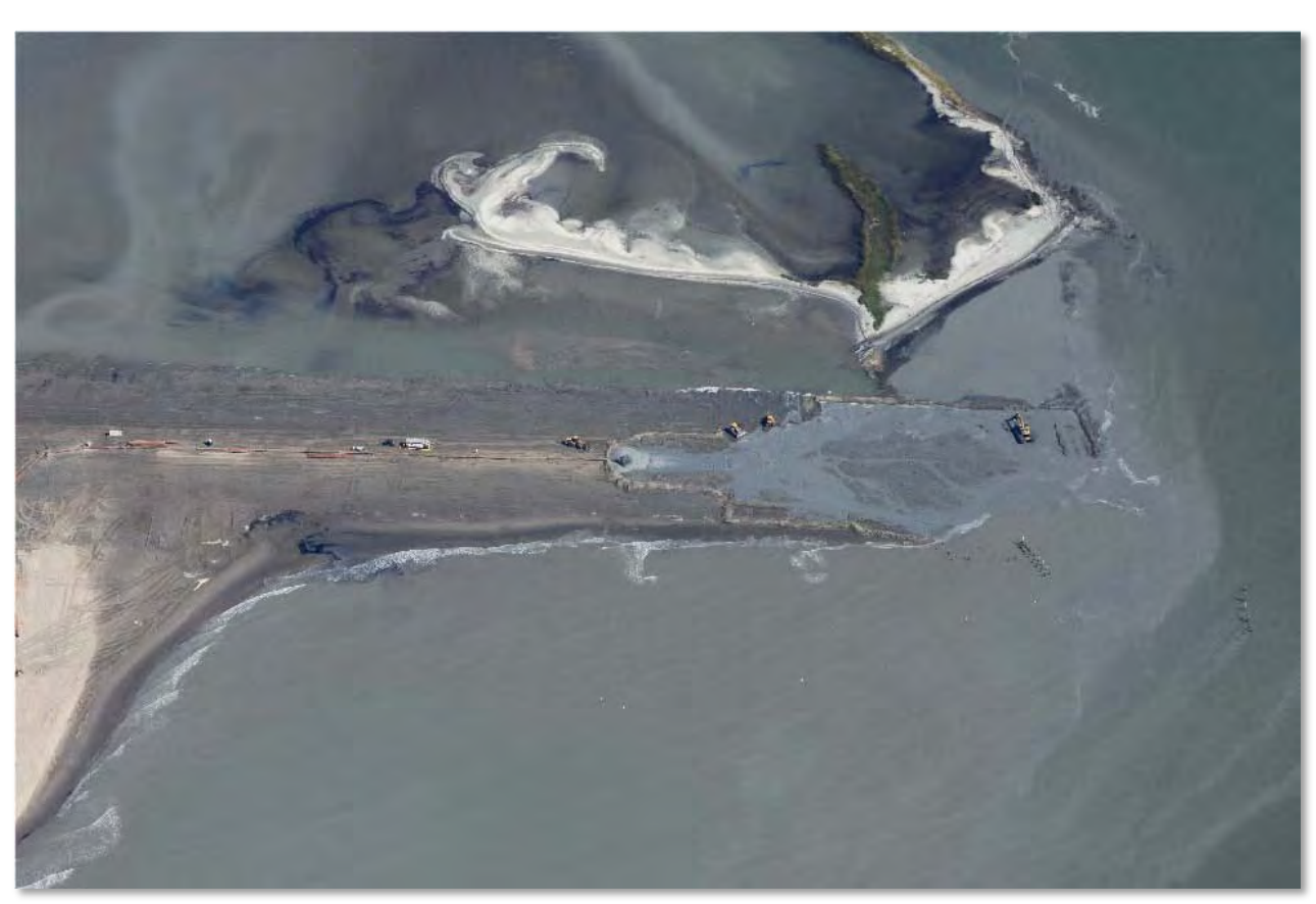
Eastern end of W8 Berm - October 31, 2010

Shaw Environmental & Infrastructure Group