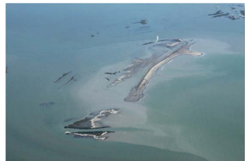
W8 Berm – October 31, 2010