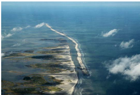
E4 Berm – October 31, 2010

Note: Under Construction represents linear footage of berm placed; all material may not yet conform to elevation +6.