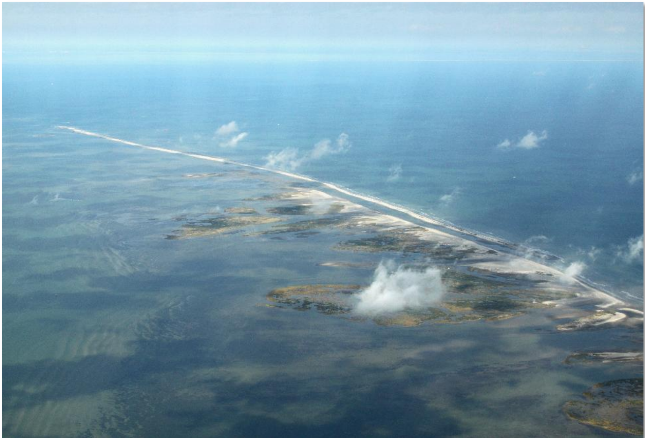
E4 North Berm – October 31, 2010

Prepared by: Shaw Environmental & Infrastructure Group