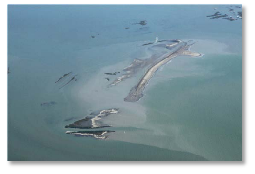
W8 Berm - October 31, 2010