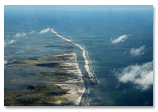
E4 Berm - October 31, 2010

Note: Under Construction represents linear footage of berm placed; all material may not yet conform to elevation +6.