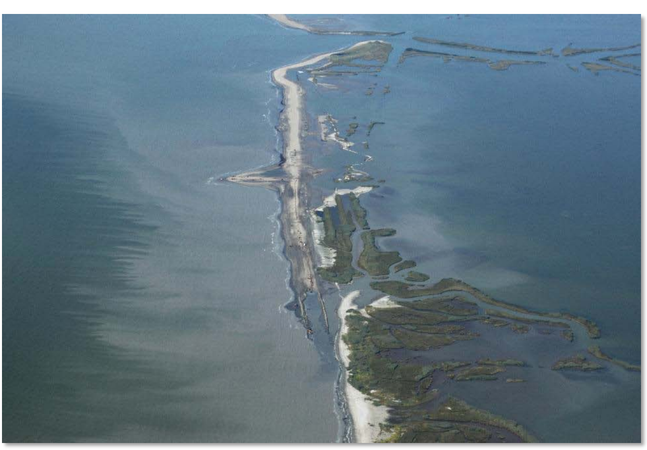
W10 North Berm - October 31, 2010

Shaw Environmental & Infrastructure Group