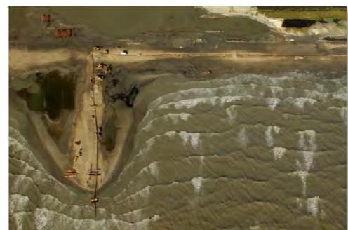
W10 Berm Operations – October 24, 2010