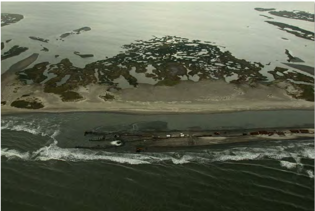
E4 North Berm – October 26, 2010

Shaw Environmental & Infrastructure Group