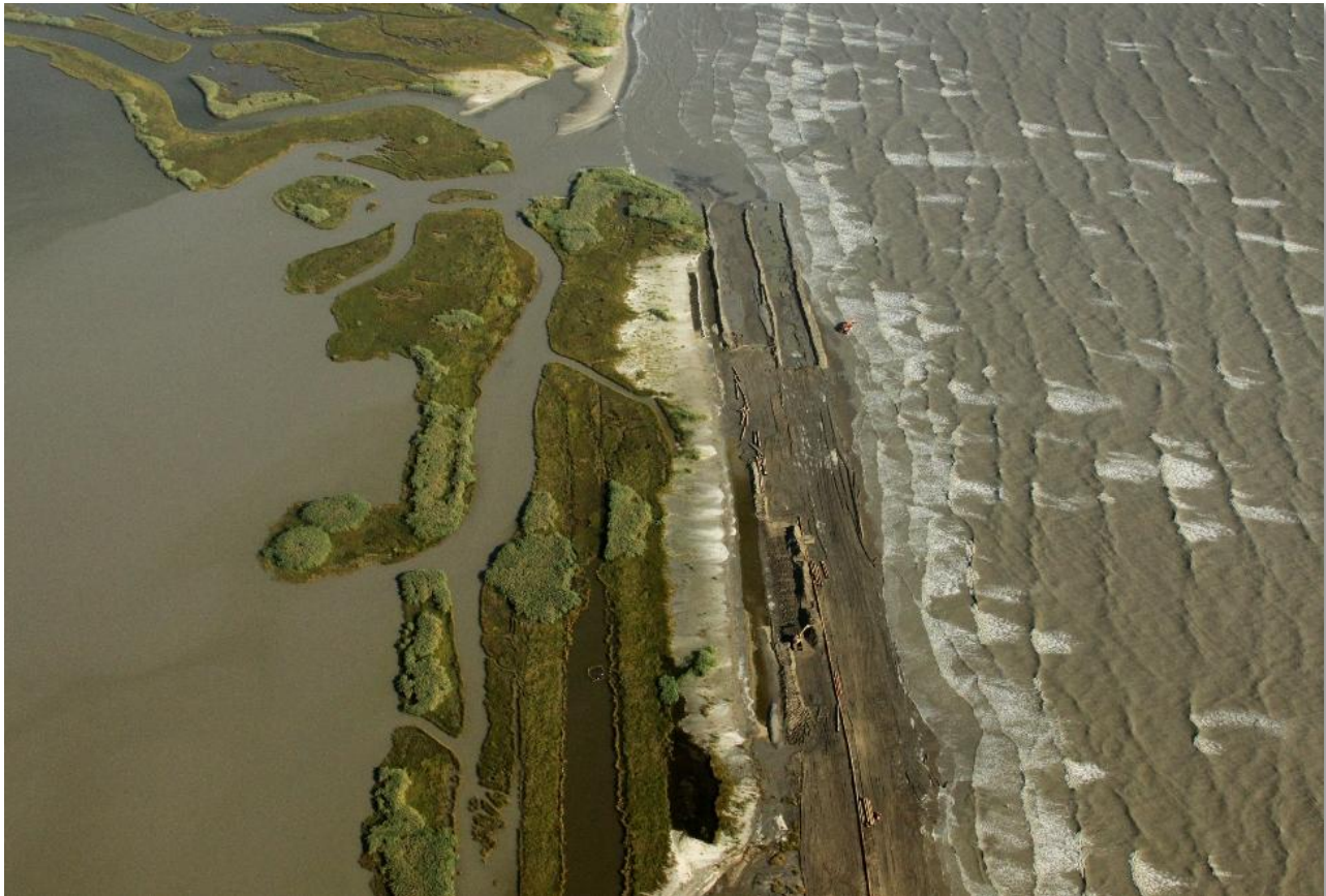
W10 Berm – October 26, 2010

Shaw Environmental & Infrastructure Group