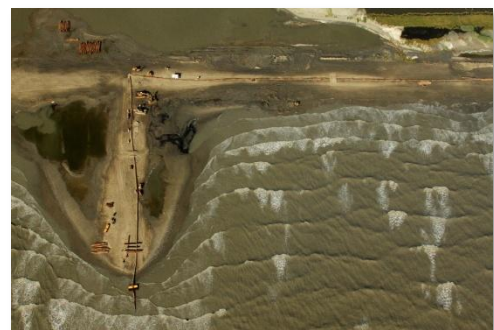
W10 Berm Operations – October 24, 2010