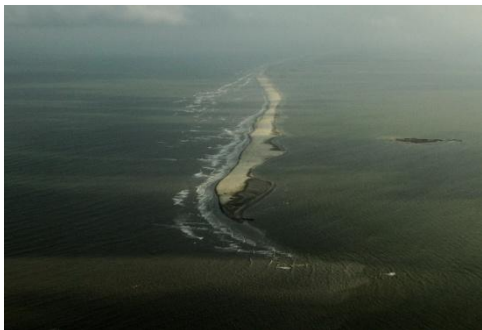
E4 Berm – October 26, 2010

Note: Under Construction represents linear footage of berm placed; all material may not yet conform to elevation +6.