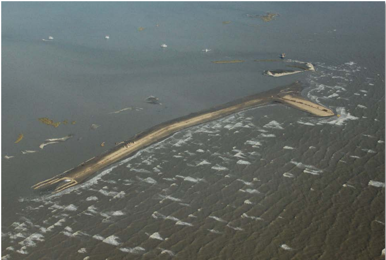
W8 Berm – October 26, 2010

Shaw Environmental & Infrastructure Group