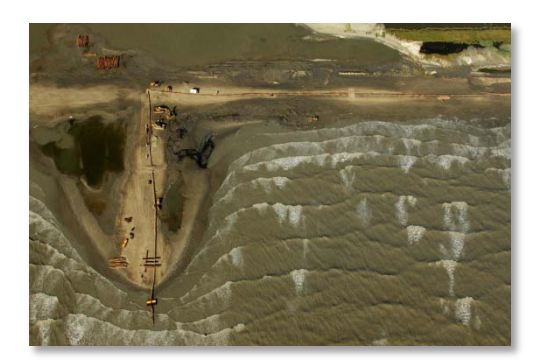
W10 Berm Operations - October 24, 2010