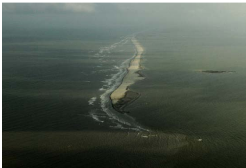
E4 Berm – October 26, 2010

Note: Under Construction represents linear footage of berm placed; all material may not yet conform to elevation +6.