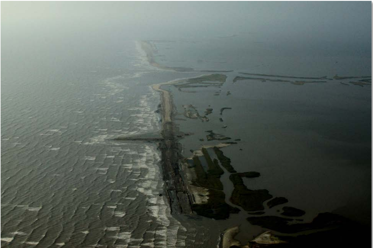
W10 & W9 Berms – October 26, 2010

Shaw Environmental & Infrastructure Group