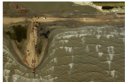
W10 Berm Operations – October 24, 2010