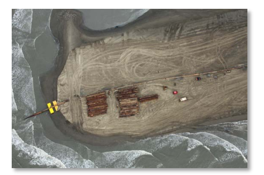
W8 Berm Operations - October 24, 2010