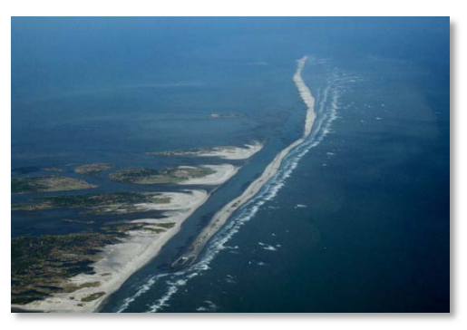
E4 Berm - October 24, 2010

Note: Under Construction represents linear footage of berm placed; all material may not yet conform to elevation +6.