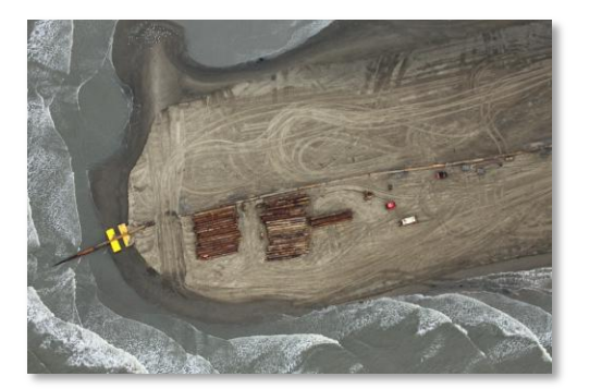
W8 Berm Operations - October 24, 2010