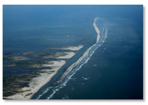
E4 Berm – October 24, 2010

Note: Under Construction represents linear footage of berm placed; all material may not yet conform to elevation +6.