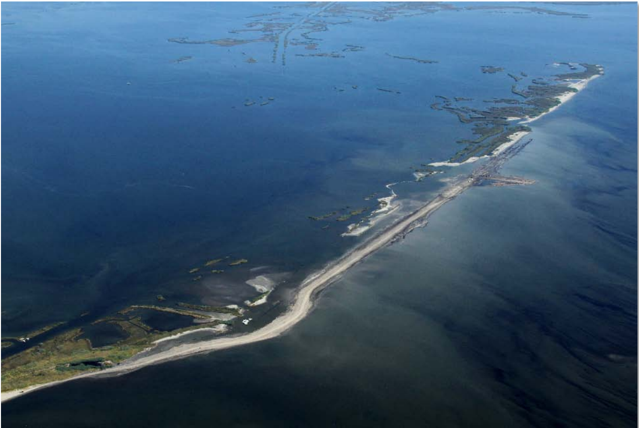
W10 Berm – October 19, 2010

Shaw Environmental & Infrastructure Group