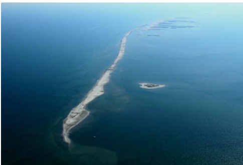
E4 Berm – October 19, 2010

Note: Under Construction represents linear footage of berm placed; all material may not yet conform to elevation +6.