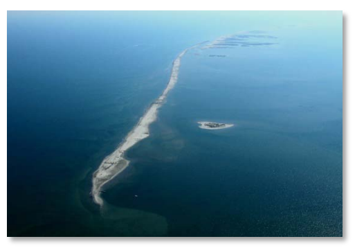
E4 Berm - October 19, 2010

Note: Under Construction represents linear footage of berm placed; all material may not yet conform to elevation +6.