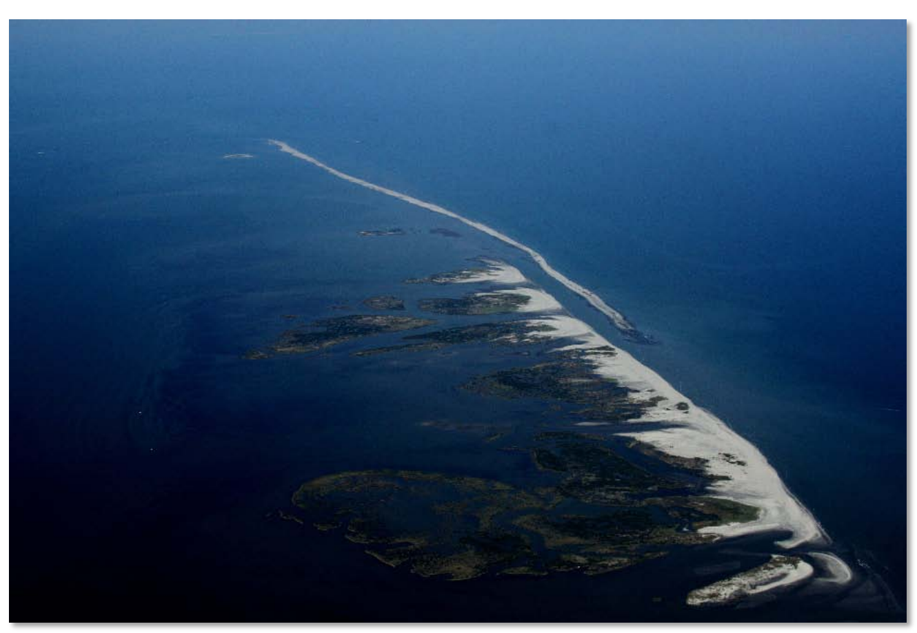
E4 Berm - October 19, 2010

Shaw Environmental & Infrastructure Group