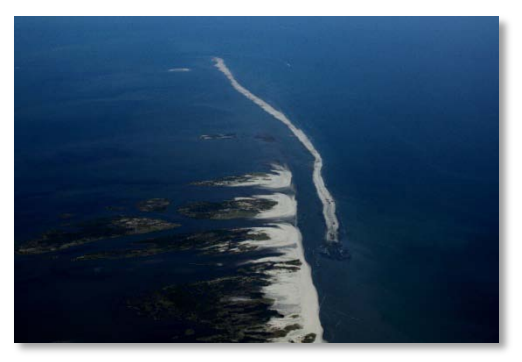
E4 Berm – October 19, 2010

Note: Under Construction represents linear footage of berm placed; all material may not yet conform to elevation +6.