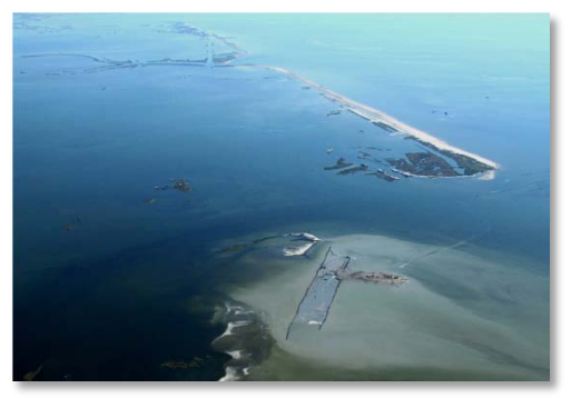
W8 & W9 Berm Operations - October 19, 2010