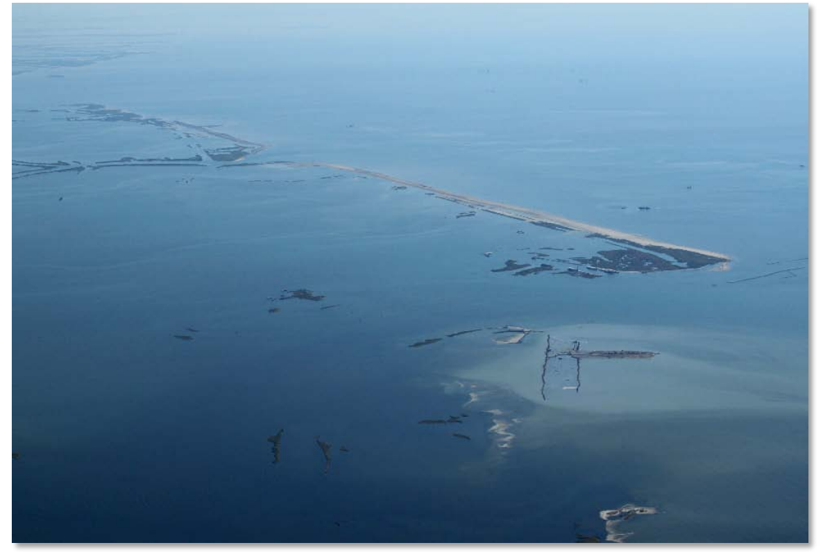
W8, W9, & W10 Berms – October 19, 2010

Prepared by: Shaw Environmental & Infrastructure Group