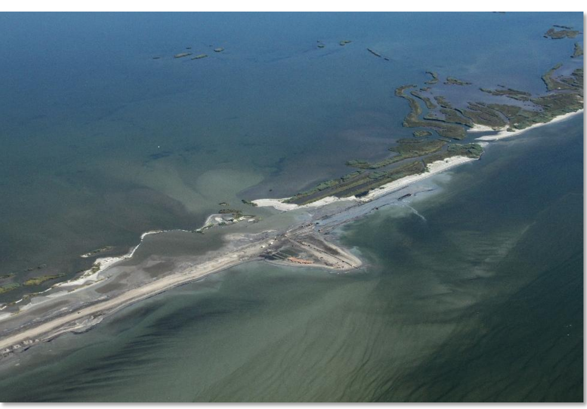
W10 Berm - October 17, 2010

Shaw Environmental & Infrastructure Group