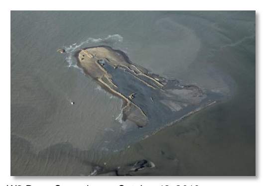
W8 Berm Operations - October 13, 2010