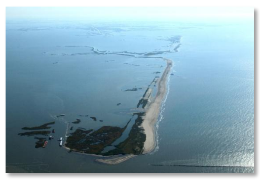
W9 Berm - October 13, 2010

Note: Under Construction represents linear footage of berm placed; all material may not yet conform to elevation +6.