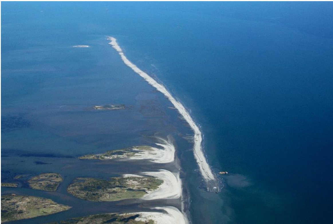
E4 North Berm – October 13, 2010

Shaw Environmental & Infrastructure Group