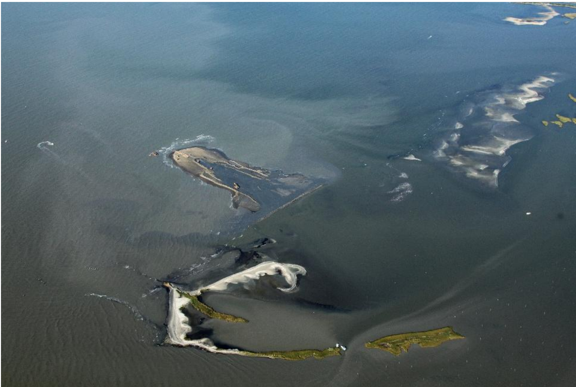
W8 Initial Pad – October 13, 2010

Shaw Environmental & Infrastructure Group