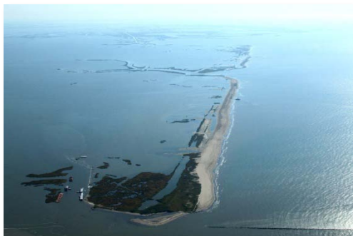
W9 Berm – October 13, 2010

Note: Under Construction represents linear footage of berm placed; all material may not yet conform to elevation +6.