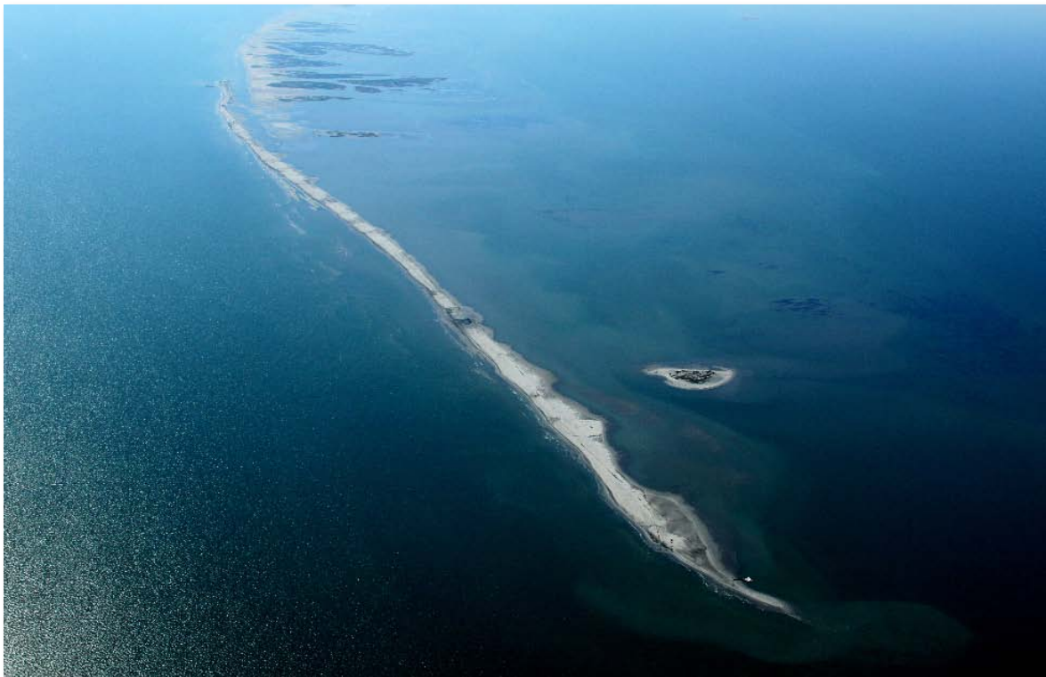
E4 North – October 13, 2010

Shaw Environmental & Infrastructure Group