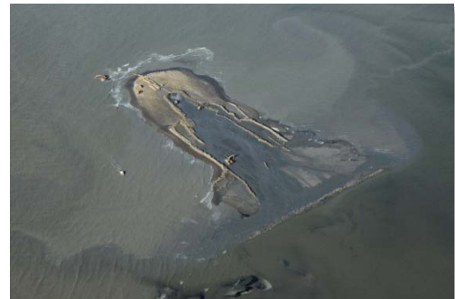
W8 Berm Operations – October 13, 2010