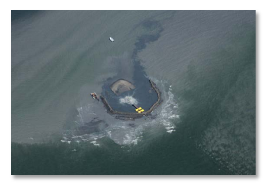
W8 Berm Operations - October 10, 2010