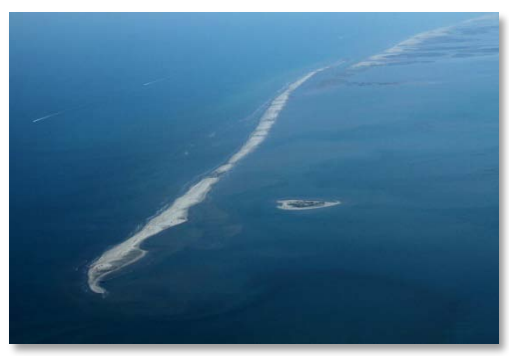
E4 North Berm - October 10, 2010

Note: Under Construction represents linear footage of berm placed; all material may not yet conform to elevation +6.