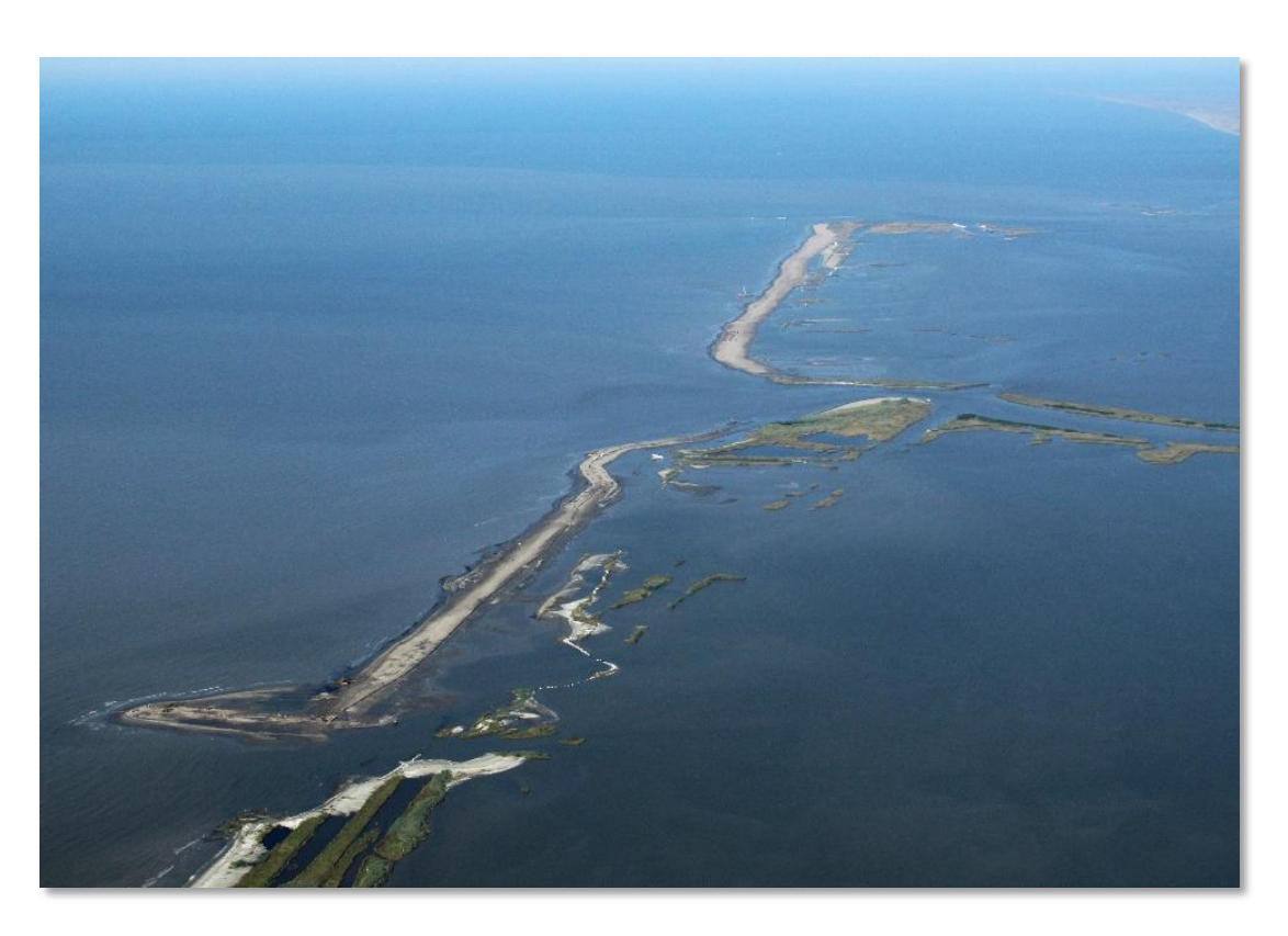
W9 & W10 - October 13, 2010

Shaw Environmental & Infrastructure Group