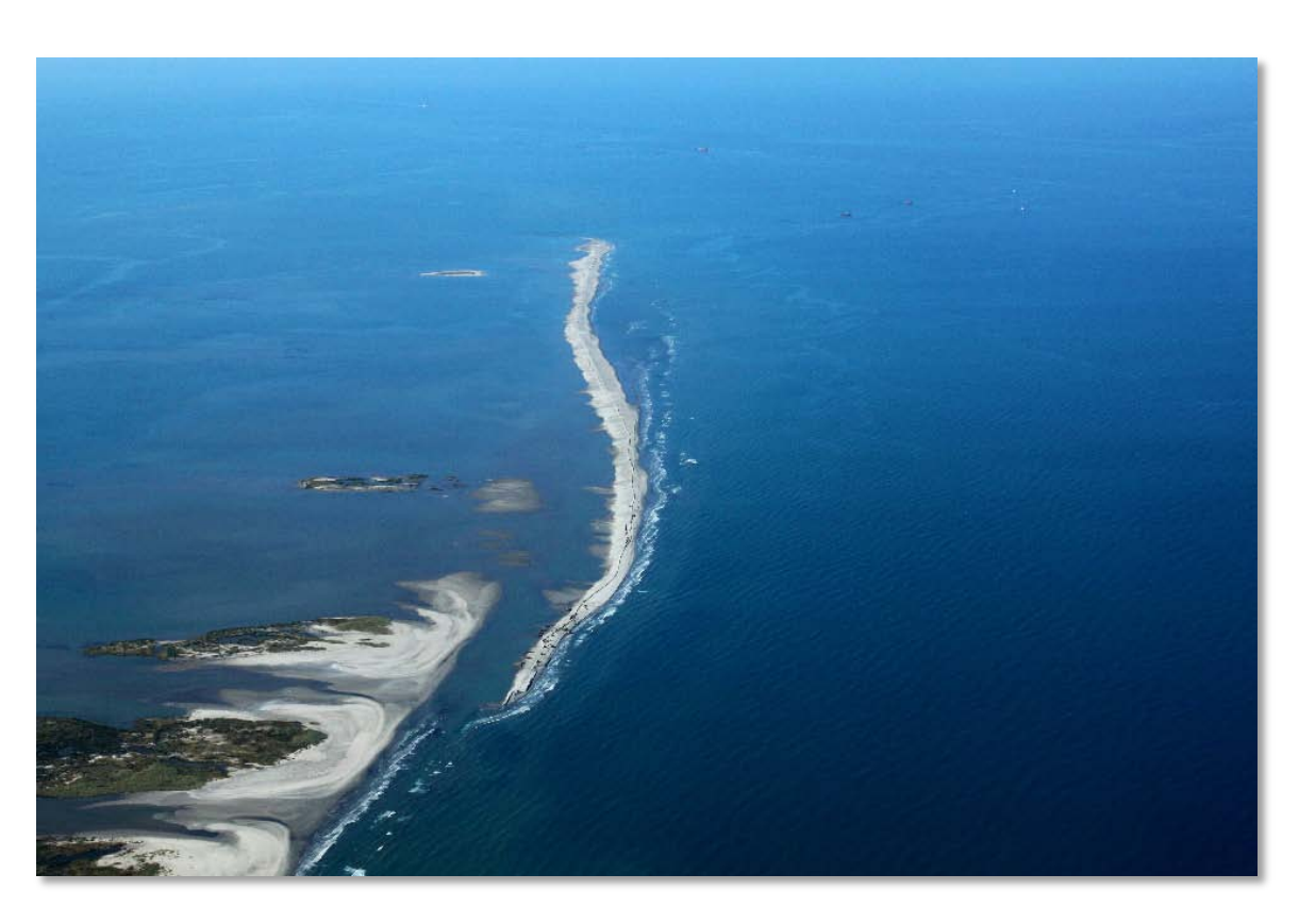
E4 North Berm - October 7, 2010

Shaw Environmental & Infrastructure Group