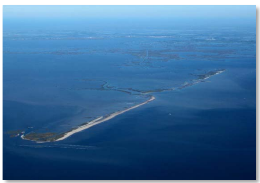
W9 & W10 - October 7, 2010

Note: Under Construction represents linear footage of berm placed; all material may not yet conform to elevation +6.