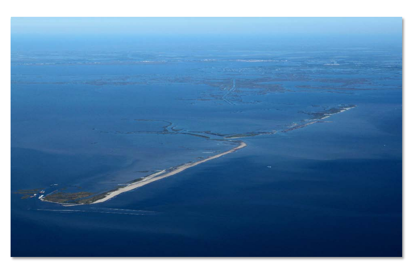
W9 & W10 Berm - October 7, 2010

Shaw Environmental & Infrastructure Group