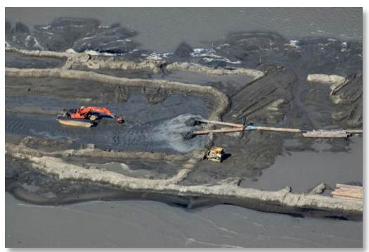
W10 Berm Operations - October 6, 2010

Note: Under Construction represents linear footage of berm placed; all material may not yet conform to elevation +6.