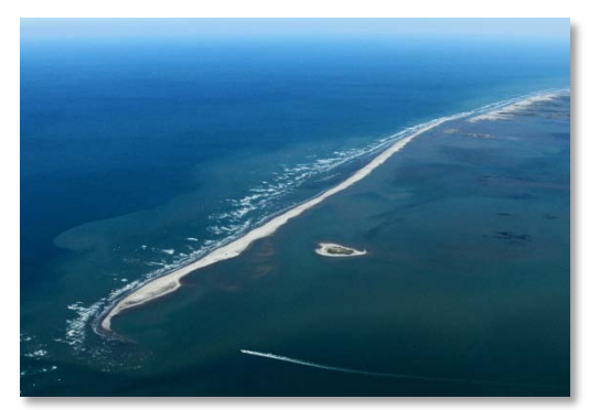
E4 North Berm Operations – October 6, 2010