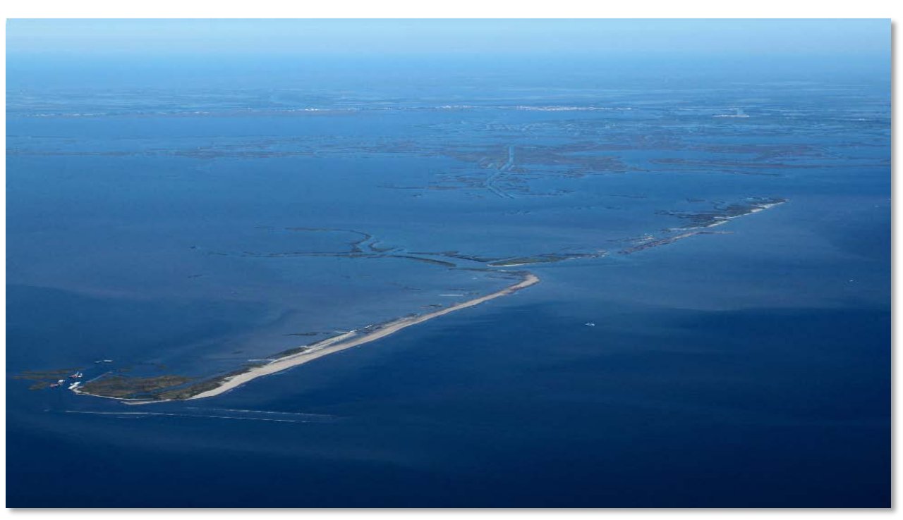
W9 & W10 Berm - October 6, 2010

Shaw Environmental & Infrastructure Group