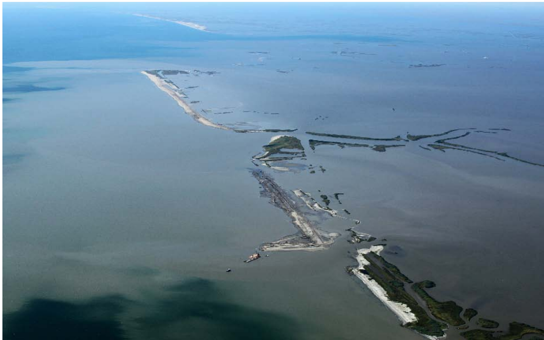
W9 & W10 Berm – October 6, 2010

Shaw Environmental & Infrastructure Group