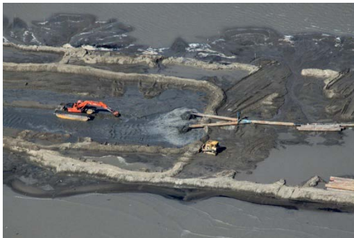
W10 Berm Operations – October 6, 2010

Note: Under Construction represents linear footage of berm placed; all material may not yet conform to elevation +6.