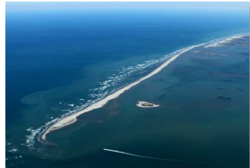
E4 North Berm Operations – October 6, 2010