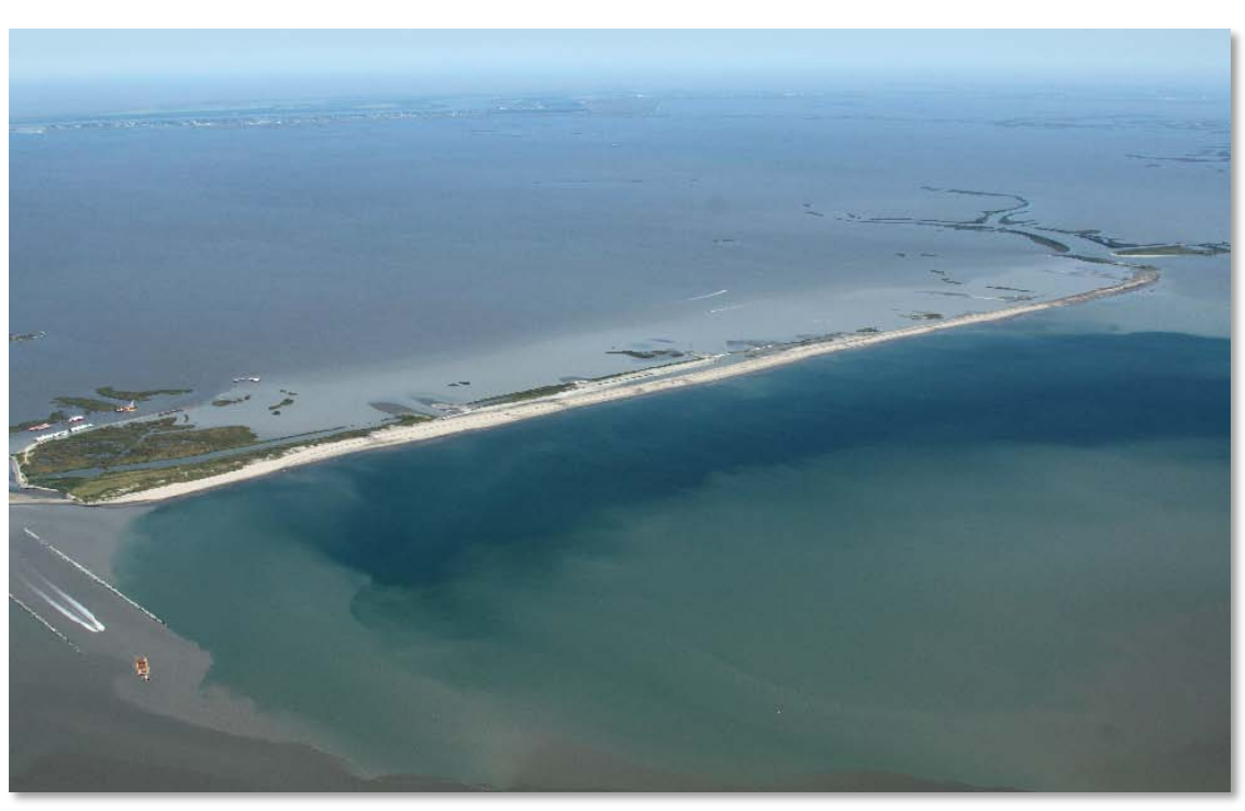
W9 Berm - October 3, 2010

Shaw Environmental & Infrastructure Group