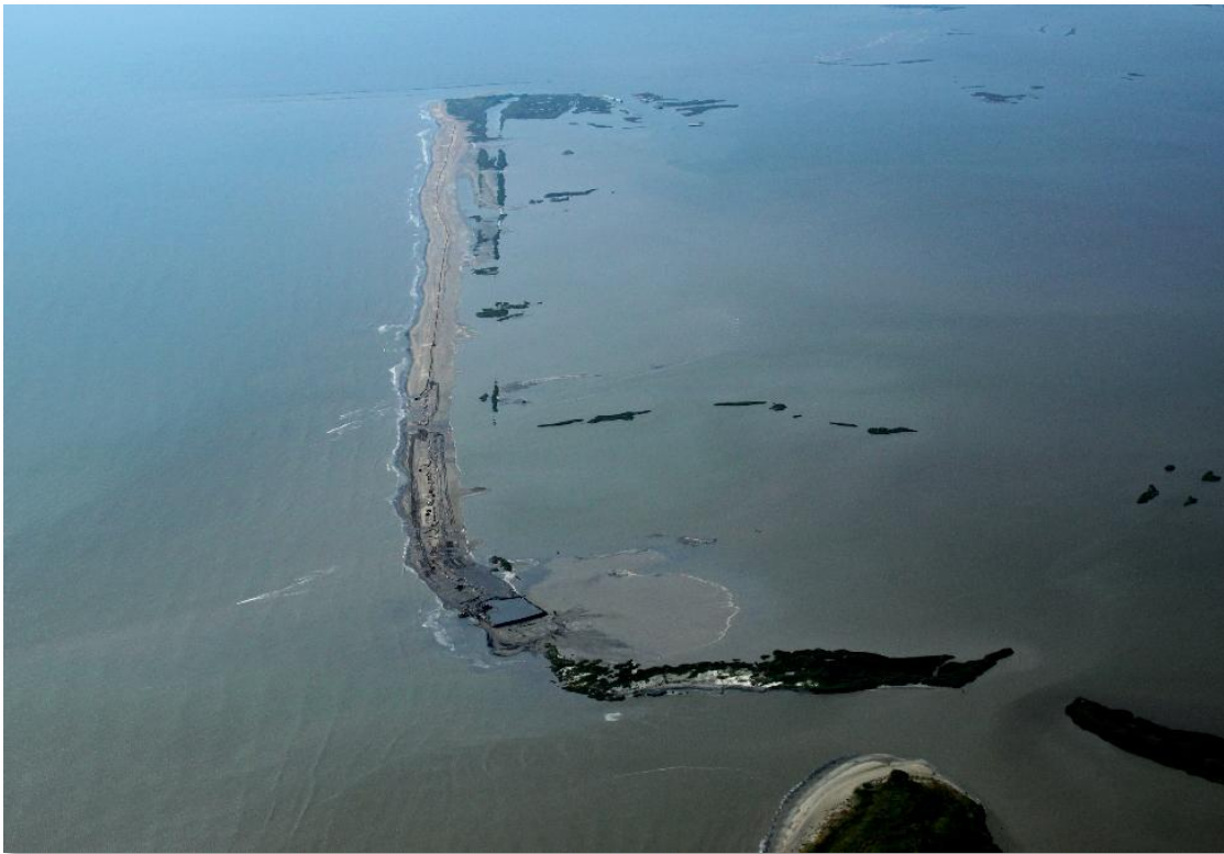
W9 Berm – September 28, 2010

Prepared by: Shaw Environmental & Infrastructure Group