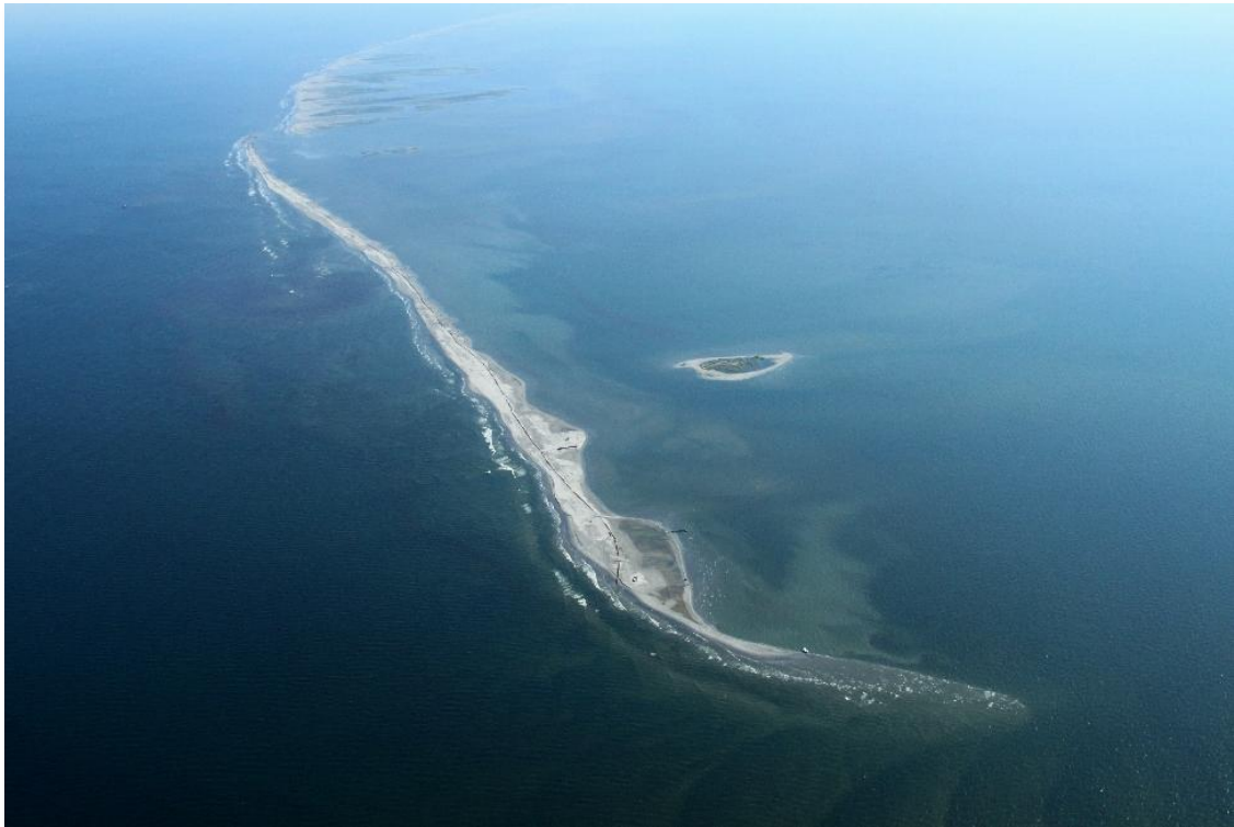
E4 North Berm – September 28, 2010

Prepared by: Shaw Environmental & Infrastructure Group