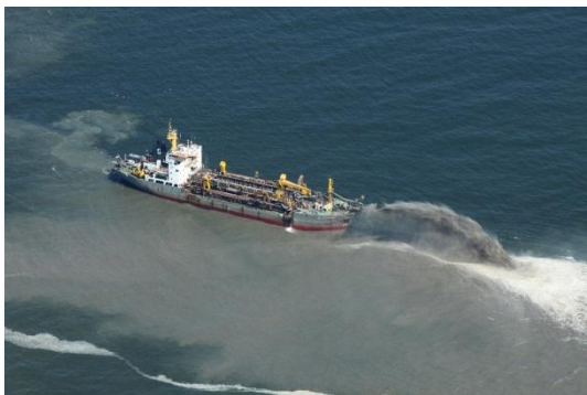
Stuyvesant Borrow Operations – September 23, 2010

Note: Under Construction represents linear footage of berm placed; all material may not yet conform to elevation +6.