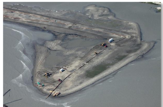
W10 Berm Operations– September 28, 2010